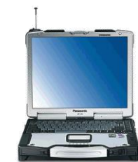
Mission Planning Support Client