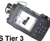
EKMS Tier 3